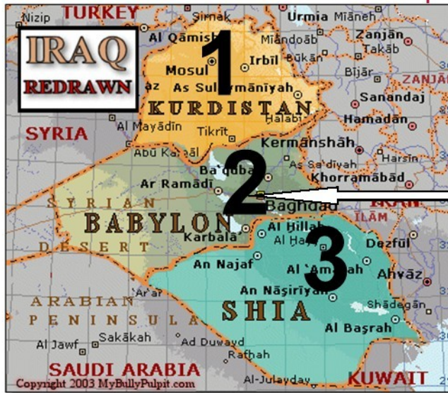
International Autonomus Area: Green Zone

Could the “dividing of Iraq” after 11/07/06 into four separate areas, be the latter day fulfillment of Alexander’s the Great’s “two-part” prophecy in Daniel Chapter 8 ?