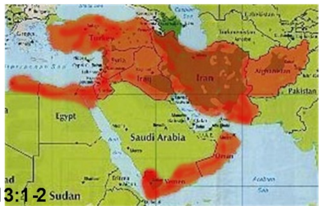
Revelation 13:1-2 Sudan

1) And I stood upon the sand of the sea, and saw a beast rise up out of the sea, having seven heads and ten horns, and upon his horns ten crowns. and upon his heads the name of blasphemy. 2) And the beast which I saw was like unto a leopard, and his feet were as the feet of a bear, and his mouth as the mouth of a lion: and the dragon gave him his power, and his seat, and great authority.