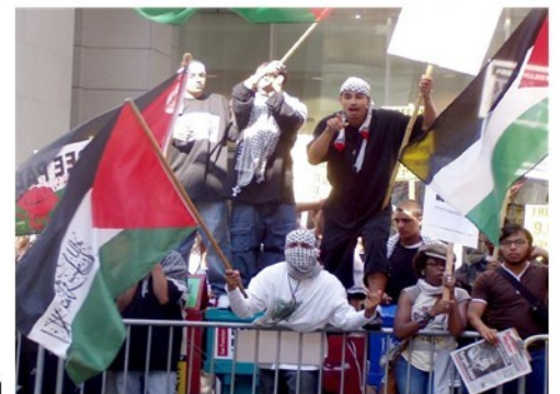
"Tulband, als je in Kabul bent."